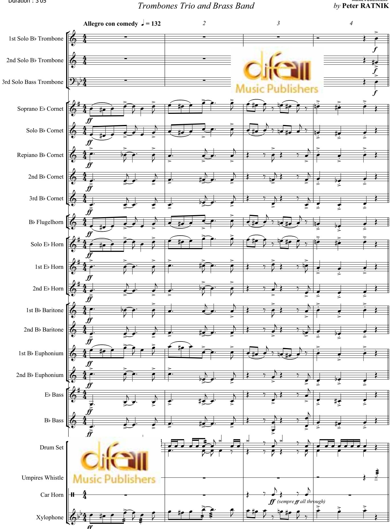
Difem SA Music Publishers - Faubourg du Lac 43 - CH 2000 Neuchâtel, SWITZERLAND [dif 107335P/10] - International Copyright Secure - All Rights Reserved

© Difem Music Publishers, Faubourg du Lac 43 - 2000 Neuchâtel, SWITZERLAND [dif 107334BB/107335FSBB/10] www.difem.ch