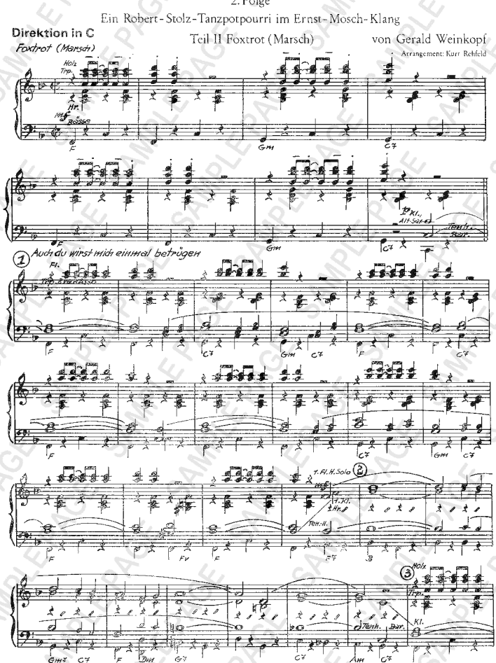
Dre07 © 1973 by Dreiklang-Dreimasken Bühnen- und Musikverlag GmbH., Berlin- München (1) und (2) mit freundlicher Genehmigung der Edition Rex Musikverlag KG. München © by Musikverlag Wilhelm Halter GmbH, Karlsruhe