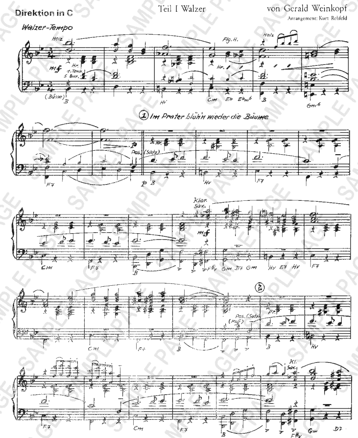
Dre07 © 1973 by Dreiklang-Dreimasken Bühnen- und Musikverlag GmbH., Berlin- München (1) und (2) mit freundlicher Genehmigung der Edition Rex Musikverlag KG. München © by Musikverlag Wilhelm Halter GmbH. Karlsruhe

Ein Robert-Stolz-Tanzpotpourri im Ernst-Mosch-Klang